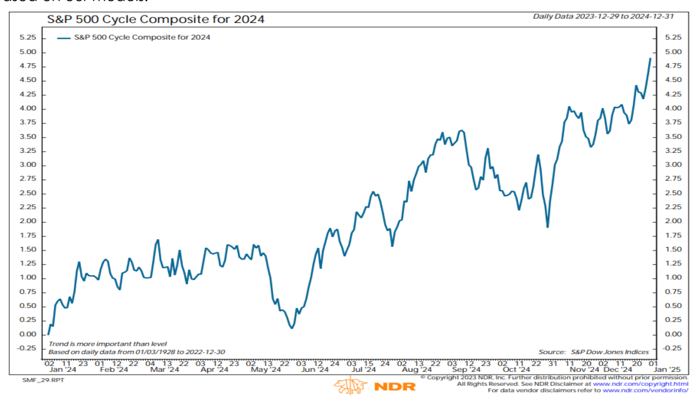
Figure 1: S&P 500 Cycle Composite for 2024 – trend is more important than level. | This implies a choppy first half but a better second half. NDR states, "This is consistent with our macro expectations as slowing growth, fiscal tightening, and election uncertainty are expected to give way to a more constructive second half... but as always, if and when we reduce our... equity allocation will be based on our models."

Note : The NDR Cycle Composite is a combination of three historical price patterns: the one-year cycle, the four-year cycle (election years for 2024), and the ten-year cycle (years ending in four).