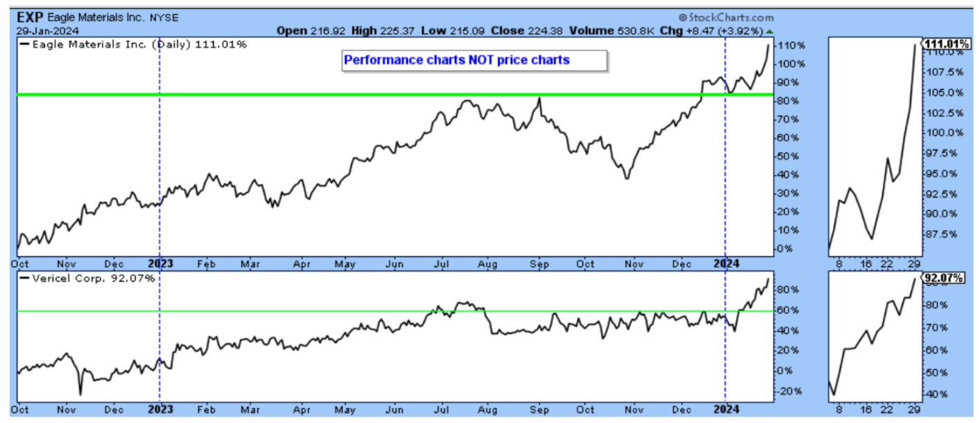
Day Hagan Tech Talk | Page 2 of 5

Figure 3: Performance Since October 2022 – figures in white box on right. | Identify price support while implementing a risk management discipline ( tighten stop loss points, at a minimum ) if you are involved in any of these. I feel the odds favor that the rate of ascent will/should slow, and at some point, change. Especially if the equity market broadens again and the negative divergences are alleviated.