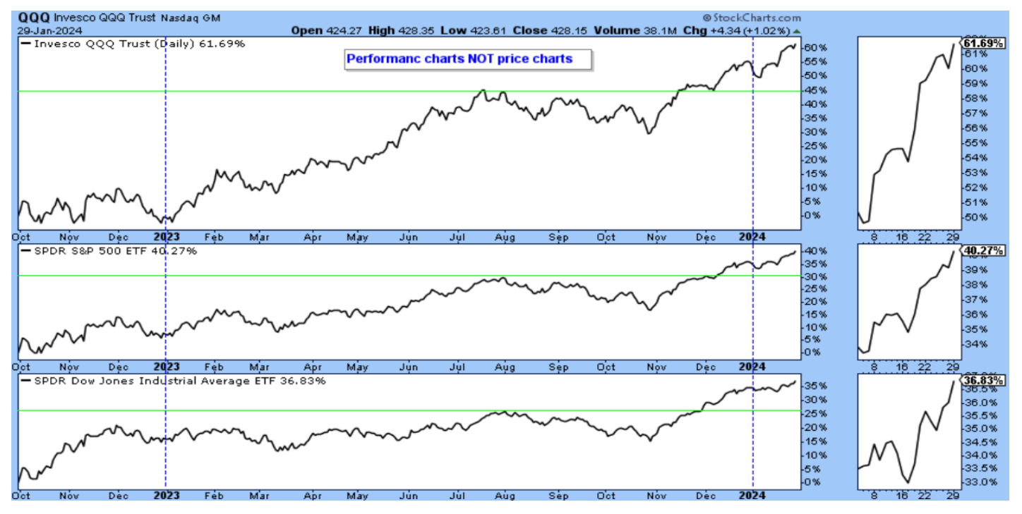
Figure 1: Performance Since October 2022 – figures in white box on right. | Identify price support (please see NOTE below) while implementing a risk management discipline. I feel the odds favor that the rate of ascent will/should slow and, at some point, change. Especially if the equity market broadens again and the recent negative divergences are alleviated .

With the FOMC meeting and quarterly Treasury refunding announcements on Wednesday, several employment reports culminating with January nonfarm payrolls on Friday morning, peak week of the Q4 earnings season, with ~40% of the S&P's market cap on the calendar—we do not have a strong view on this week's Mega-Cap Tech earnings and, where possible, would consider buying downside index protection in 1-week or 2-week tenor [emphasis mine].