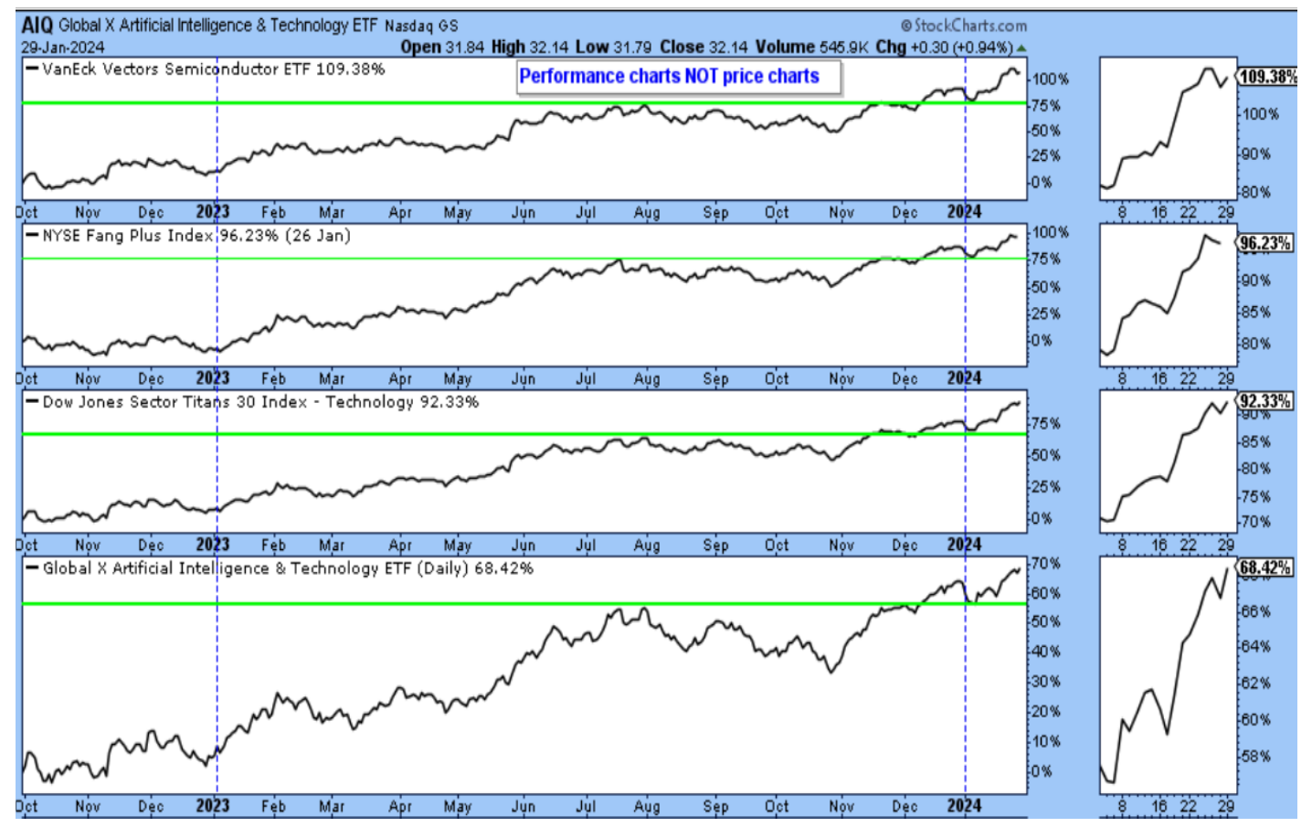
Figure 3: Performance Since October 2022 – figures in white box on right. | Identify price support while implementing a risk management discipline ( tighten stop loss points, at a minimum ) if you are involved in any of these. I feel the odds favor that the rate of ascent will/should slow, and at some point, change. Especially if the equity market broadens again and the negative divergences are alleviated.

Figure 2: Performance Since October 2022 – figures in white box on right. | Identify price support while implementing a risk management discipline. I feel the odds favor that the rate of ascent will/should slow and, at some point, change. Especially if the equity market broadens again and the recent negative divergences are alleviated.